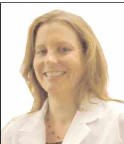
By: Jenny Crosby, DC Crosby Chiropractic & Acupuncture Centre

Acupuncture, the practice of inserting ultra-thin needles in specific points in the body, has been used for centuries to counteract the effects of disease, environmental toxins and injuries. Yet, it didn't gain prominence in the United States until the 1970's, and while it's more mainstream than in those days, it's still regarded by some as "strange medicine." However, acupuncture has been proven an effective course of treatment for many human and animal health issues. This is evidenced by the number of physicians, chiropractors and veterinarians now studying how acupuncture can support their patients' health.